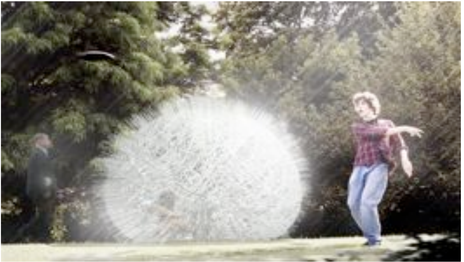
Sukkah By Hugon Kowalski of UGO Architects (Sukkah City 2010)